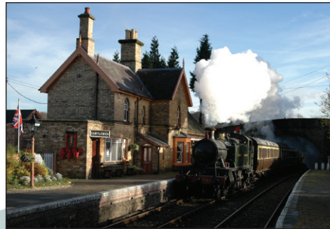
Arley is one of the most attractive stations on the line serving the village of Upper Arley on the opposite river bank. It dates from the opening of the line in 1862.