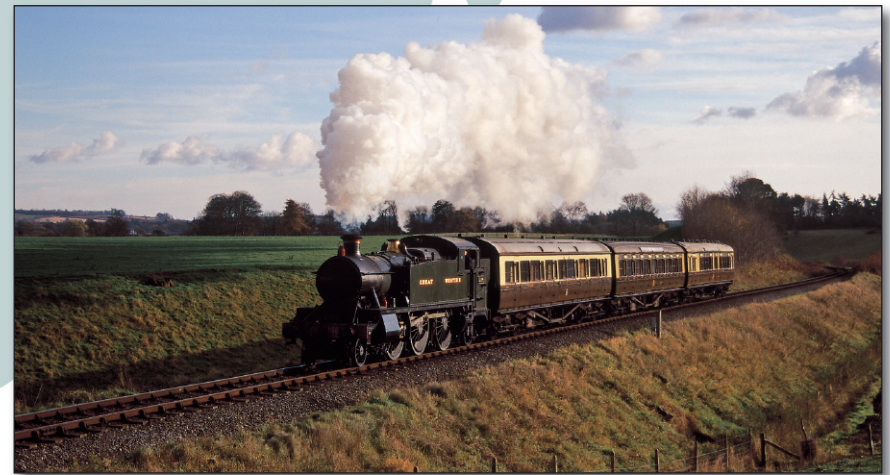
On 19 November 2004 a late afternoon 'local' in the hands of No. 5164 takes it at a more leisurely pace.