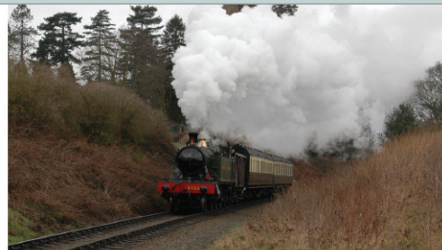
Having crossed over the Bridgnorth By-Pass 'small Prairie' GWR 2-6-2T No. 4566 powers through Oldbury Cutting back in February 2007.