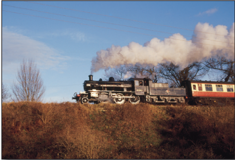
Glinting in the afternoon sunshine is LMS Ivatt Class 2-6-0 No. 46443.