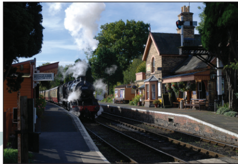
When steam services from Bridgnorth restarted in 1970, Hampton Loade was the southern terminus for passenger services. A footplate experience train in the hands of No. 42968 starts back towards Bridgnorth on a bright October 2008 morning.