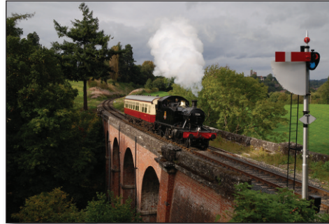
Crossing the five arch Oldbury Viaduct, during a charter on 29 September 2008, is visiting GWR Prairie No. 5526 complete with auto-coach. Both are normally based on the South Devon Railway at Buckfastleigh.