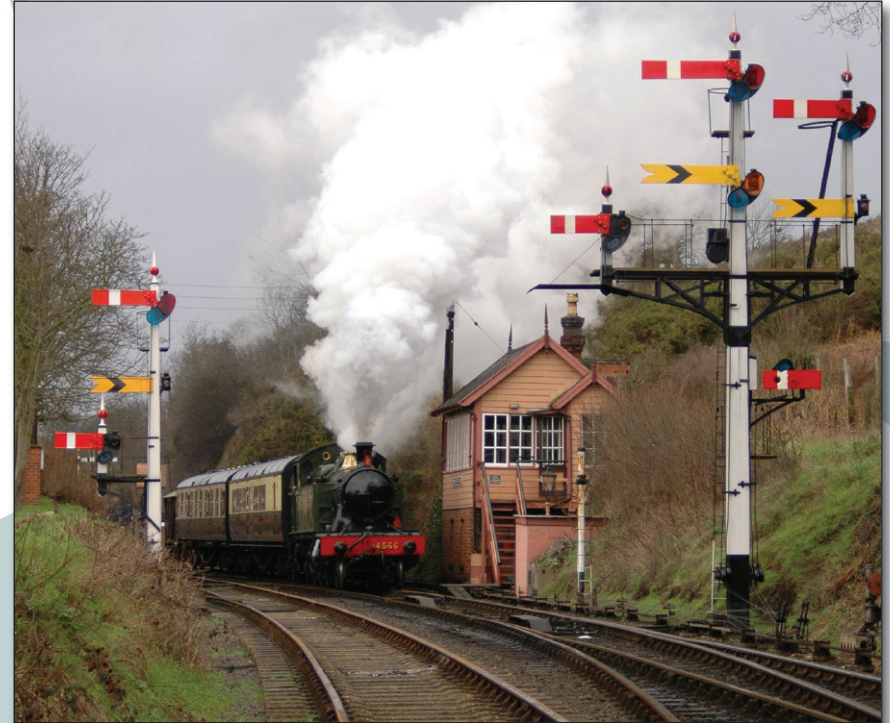
This splendid signal gantry controls all access to Kidderminster Station.