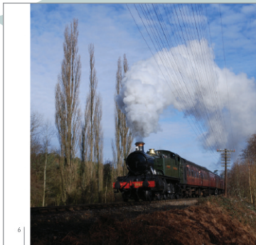
On 7 March 2009 Great Western Railway 2-6-2T No. 5164 climbs away from Bridgnorth with a morning train.